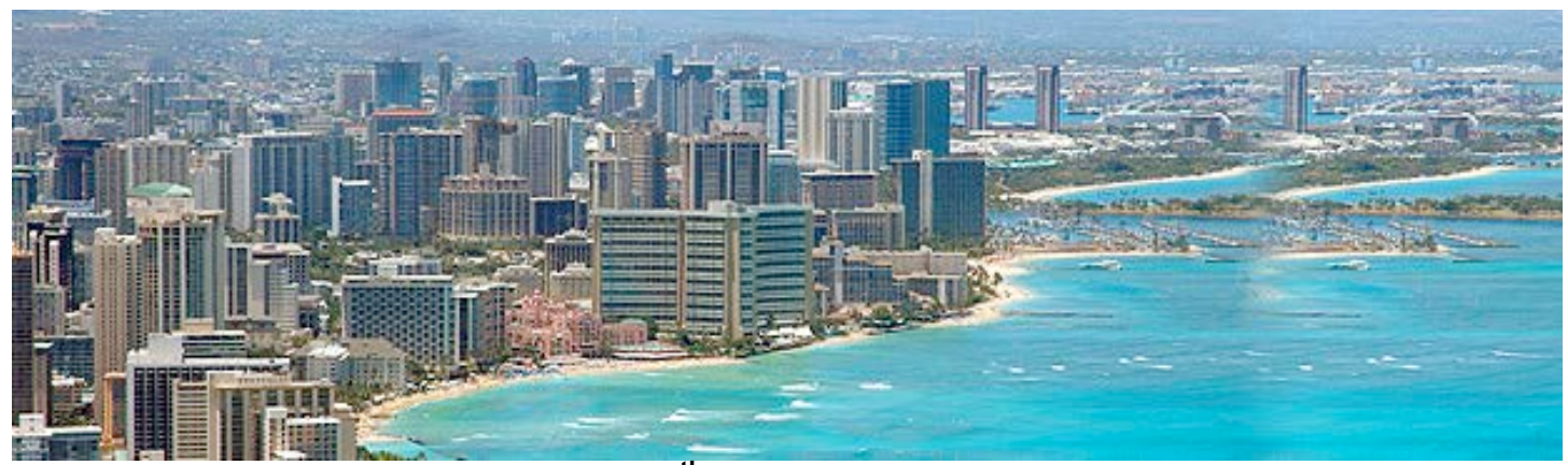
The SNIP 18<sup>th</sup> Scientific Conference Hawaii Prince Hotel - Waikiki, Honolulu, HI April 24-28, 2012

The 18<sup>th</sup> Annual Conference of the Society will be held in Honolulu, Hawaii. The Conference will maintain a focus on drugs of abuse in modulating neuroimmune processes and on HIV infection. Again, a major objective of the conference is to support young investigators and the "highlight" event will be the Young Investigator Poster Session that will be followed up by a "Meet the Mentors" luncheon at which young investigators will interact with senior investigators from academia, the National Institutes of Health, and industry to discuss career opportunities. Also, a special Young Investigator Symposium will be convened. Abstracts for travel awards for the 18<sup>th</sup> Annual Meeting of the Society on Neuroimmune Pharmacology were due December 2, 2011. General abstracts (i.e., other than those for travel awards) were due by January 15, 2012. Abstracts of the 18<sup>th</sup> Annual Meeting of the Society on Neuroimmune Pharmacology will be published in a special issue of the Journal of Neuroimmune Pharmacology.