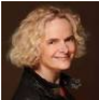
Nora Volkow, M.D. Director, National Institute on Drug Abuse (NIDA), NIH Member, National Academy of Medicine 2007 Time 100